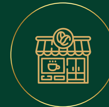
Exclusive Restaurant Coffee Shop