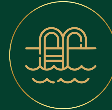
Swimming Pool with Pool Deck