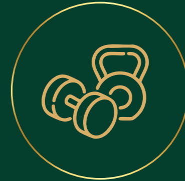
Fully Equipped Gymnasium