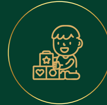
Kids Play Zone